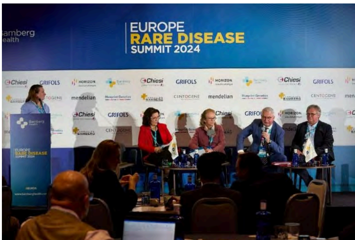
Bamberg Europe Rare Diseases Summit in Madrid

For more information and to register, click here .